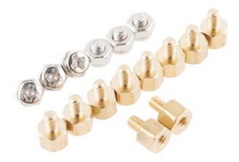
Intel Edison Hardware Pack

We have a nice Hardware Pack available that gives enough hardware to secure three blocks and an Edison.